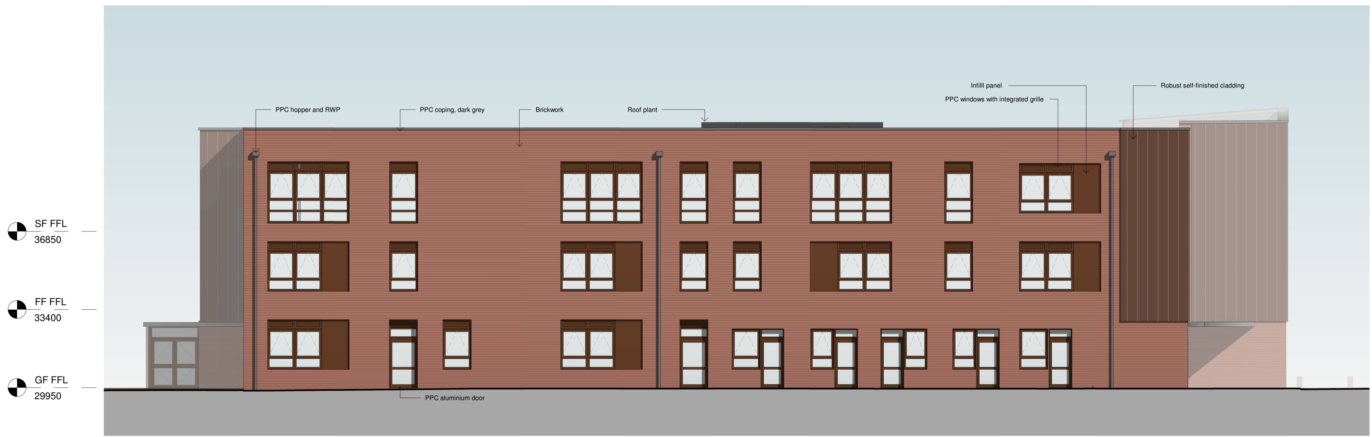
Proposed South Elevation 1 : 100

Note: Do not scale this drawing. All levels and dimensions are to be checked on site. This drawing is to be read in conjunction with all relevant consultants' requirements, drawings and specifications. Any discrepancies between consultants' drawings to be reported to the Contract Administrator before any relevant work commences. Copyright: 2012 Miller Bourne ©