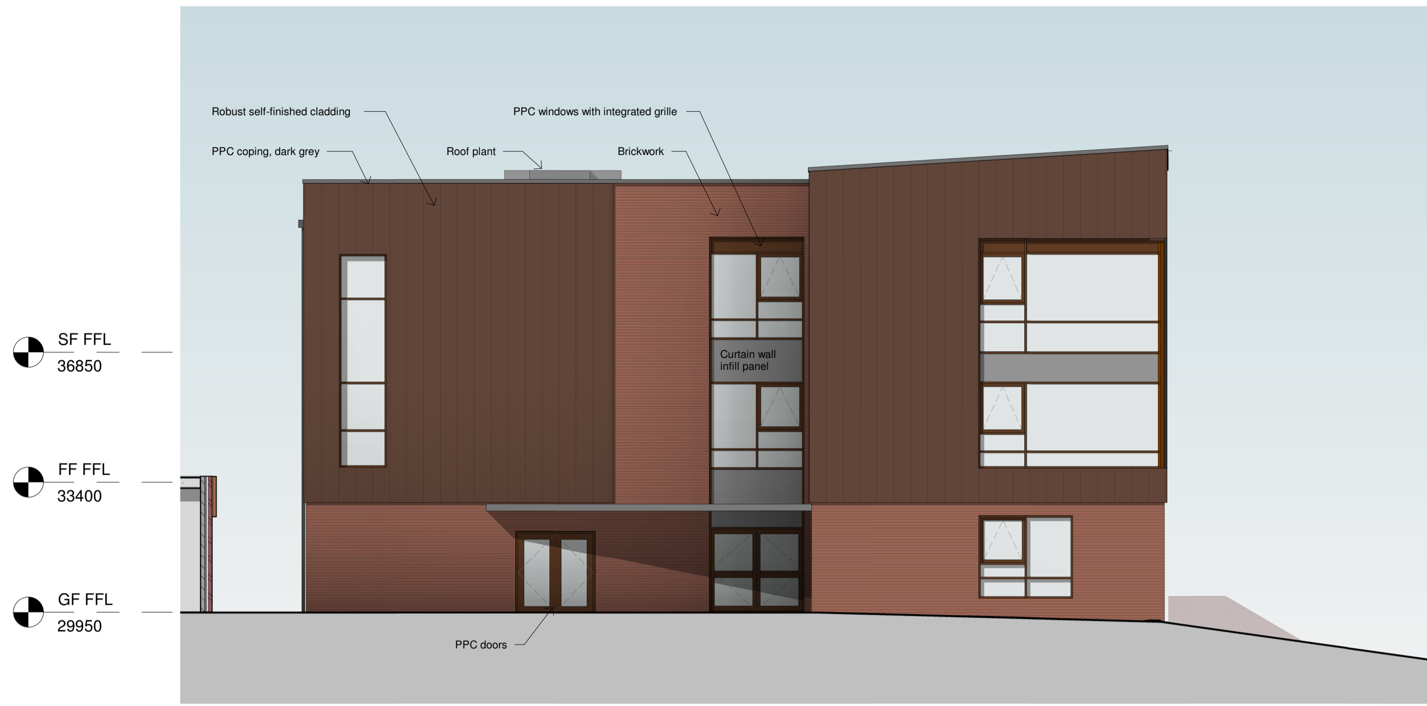
Proposed East Elevation 1 : 100